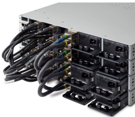
Figure 7. Cisco Catalyst 9300 Series StackPower