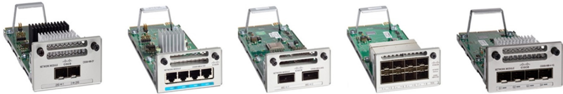
Figure 3. Cisco Catalyst 9300 Series network modules