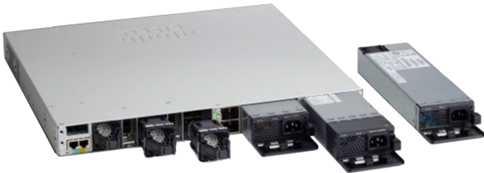
Figure 4. Cisco Catalyst 9300 Series dual redundant power supplies

Table 4 lists the different power supplies available in these switches and available PoE power.