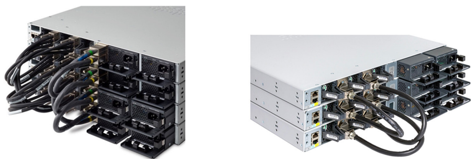
Figure 5. Cisco Catalyst 9300 Series modular uplink models stack (C9300/C9300X SKUs) and fixed uplink models stack (C9300L SKUs).

Cisco Catalyst 9300 Series Switch models are designed for stacking as a single virtual switch, enabling customers to have a single management plane and control plane for up to 448 access ports.