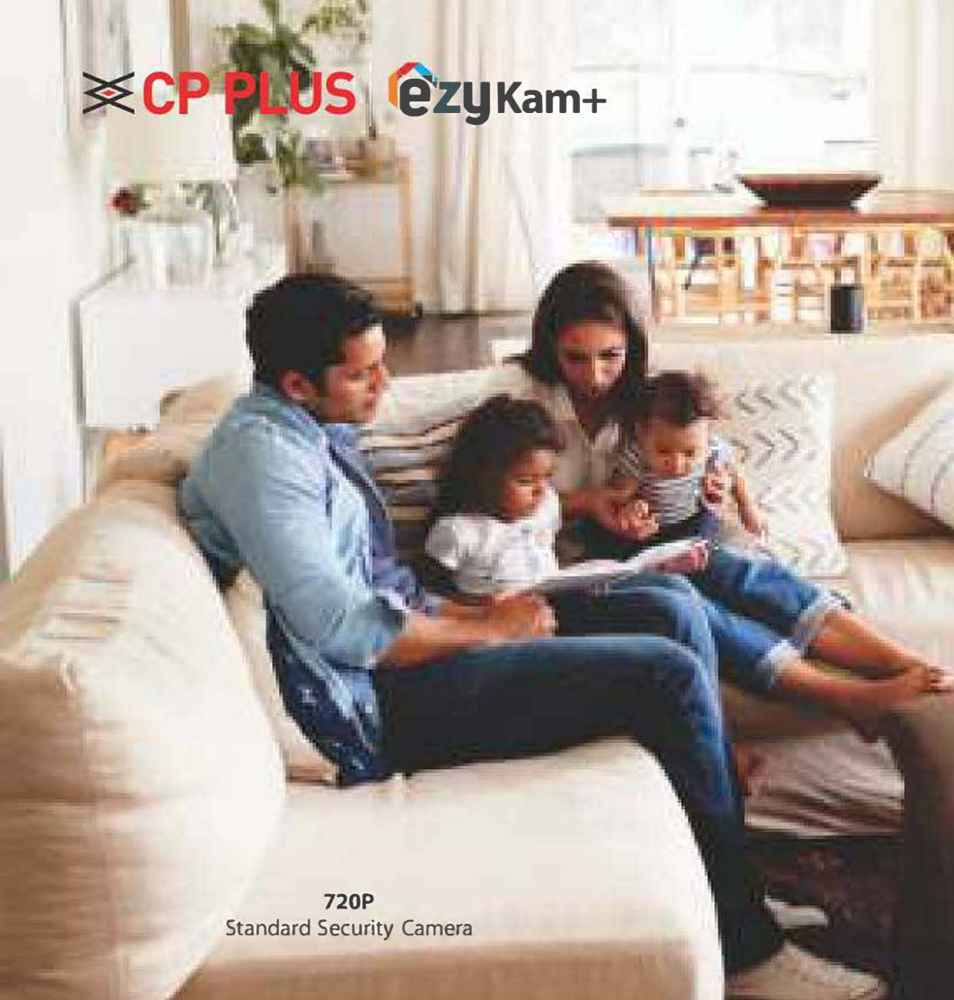
720P Standard Security Camera