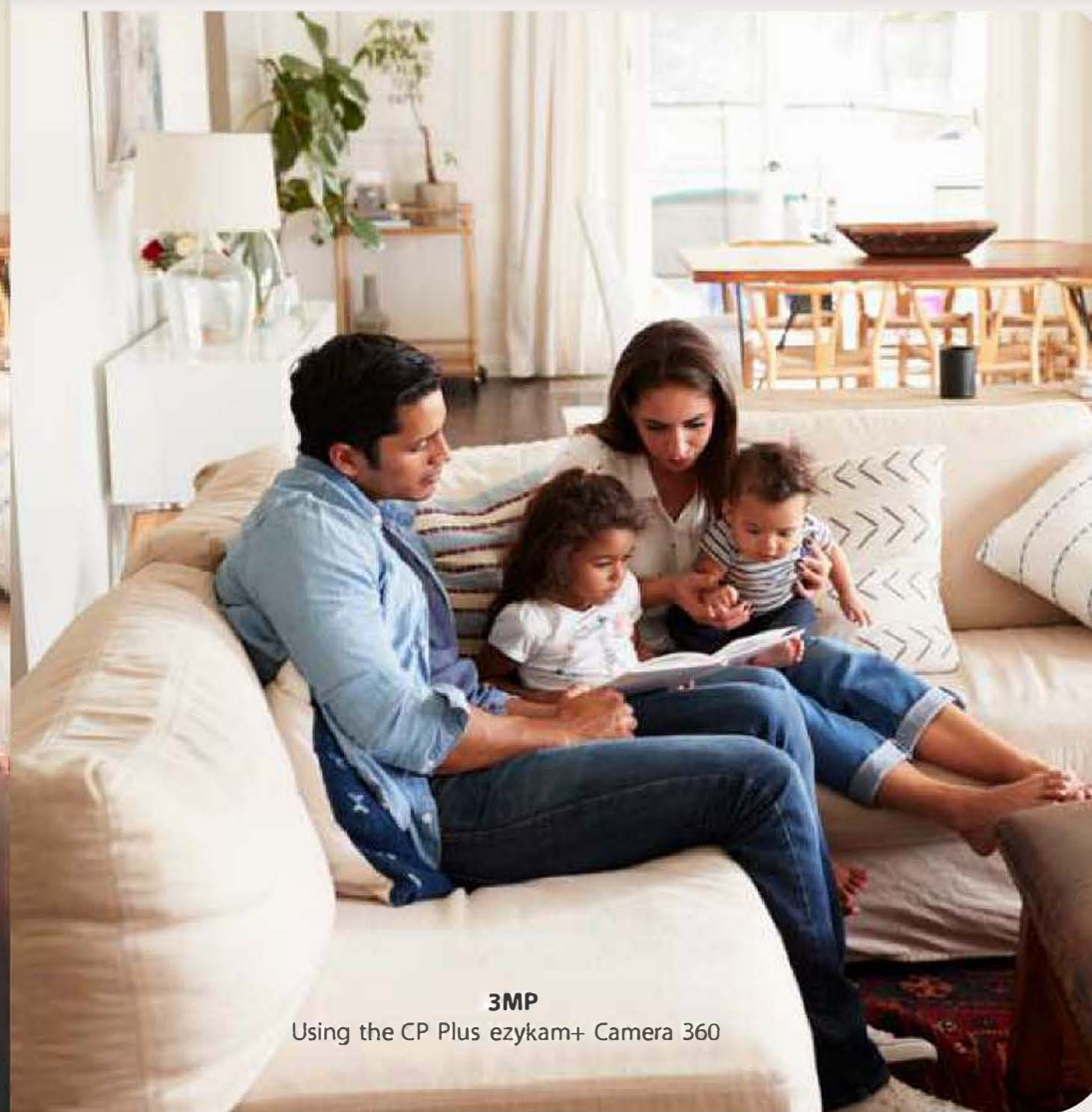
3MP Using the CP Plus ezykam+ Camera 360