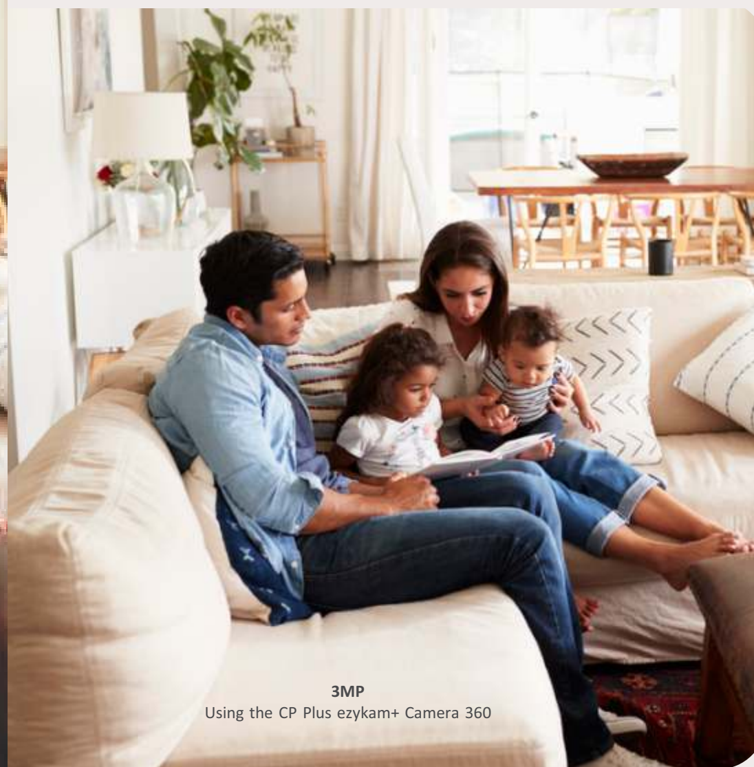
3MP Using the CP Plus ezykam+ Camera 360