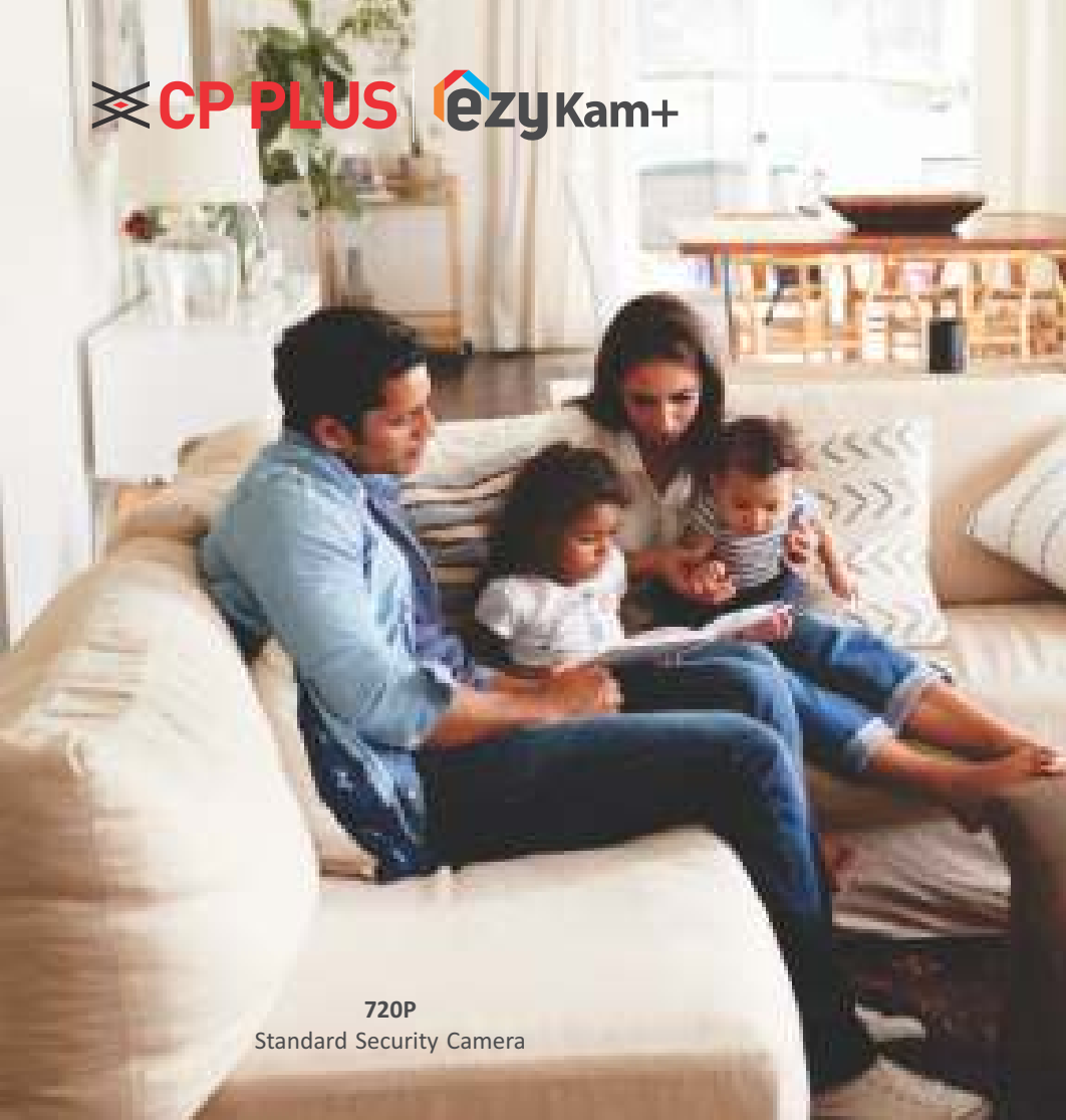
720P Standard Security Camera