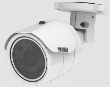
SATATYA MIBR80FL36CWP P2 8MP IR Bullet Camera with 3.6mm Lens with Audio

Matrix Professional Series IP Cameras are built using superior components such as Sony STARVIS sensor and higher MTF lens to offer unmatched image quality especially during the low light conditions. Powered by True WDR algorithm, these cameras offer consistent image quality even in highly varying lighting conditions. Built in intelligent analytics including Intrusion Detection, Trip Wire, etc. ensure real-time security. Moreover, H.265 compression and Automatic Motion based Frame Rate Reduction save bandwidth and storage up to 50%.